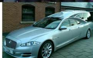
Our Silver fleet of Jaguars

112, Church Road, Yardley. B25 8UX (On Yew Tree Island) 0121 784 3230