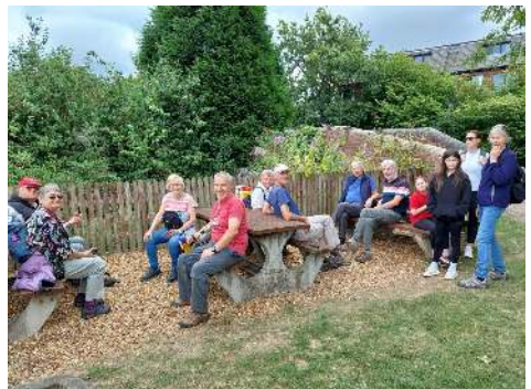
At The Wharf

Then followed almost a mile along the Stratford-Upon-Avon canal. We took a brief breather beside The Wharf public house in Hockley Heath, before crossing Hockley Heath park.