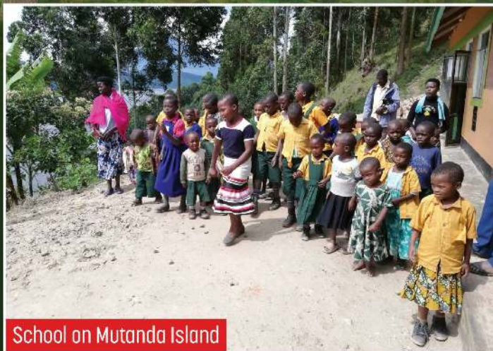
School on Mutanda Island

Tickets £20 (includes fish and chip supper) available from Phil Godfrey 07770 406 870