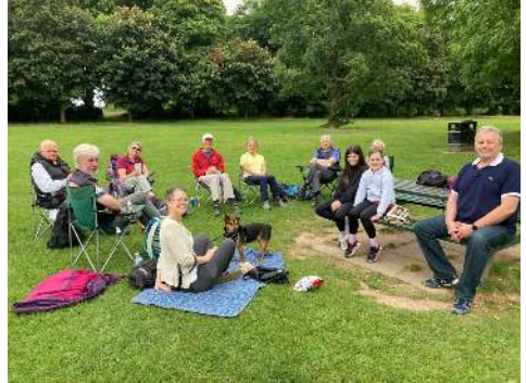
Picnic in the park

First of course was morning service ringing, which went very well with joyous ringing on all 12 of our lovely bells. Then home for a quick change before meeting up in Dorridge Park for a picnic. We each took our own food, but some brought extra treats, such as strawberries and fudge, for us all to share. Delicious! Our food attracted the attention of a French Bulldog, Milo, who was evading all his owner's attempts to catch him, which had us all laughing.