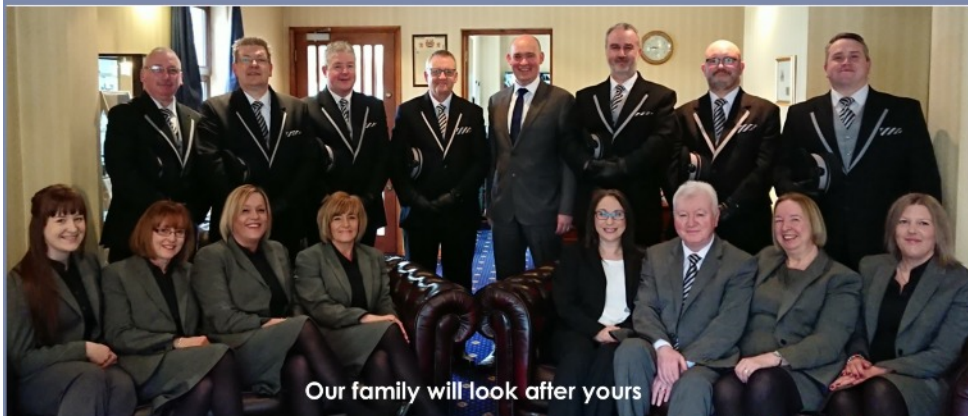
Our family will look after yours

Our dedicated full time staff will guide you through the arrangements to ensure a unique a befitting funeral.