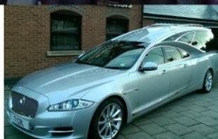
Our Silver fleet of Jaguars

112, Church Road, Yardley. B25 8UX (On Yew Tree Island) 0121 784 3230